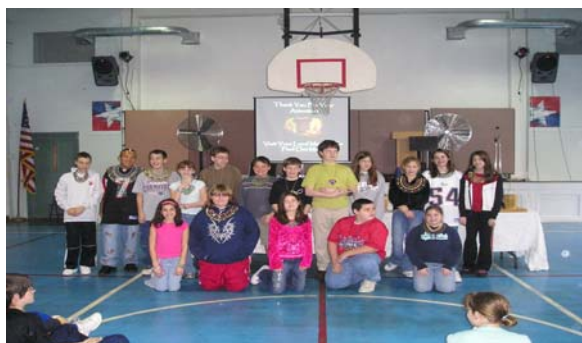
6 th Grade Pyramids & Pharaohs Program

In between shopping for holiday gifts and planning holiday meals and festivities, our Program Committee lent a hand to the celebrations at the Fuller Meadow School with a laser light show. We also brought a variety of programs and field trips to both schools, including the 3 rd grade's trip to the Wenham Museum and their visit from Helen Keller, the 6 th grade's introduction to Egyptian art and history with a Pyramids and Pharaohs program and a visit to the Egyptian and Nubian Arts exhibit at the Museum of Fine Arts, a pioneer living program for the 1 st grade, the Tanglewood Marionettes show for the pre-school and kindergarten, and, of course, this week's school-wide celebration of Italian culture at Howe Manning.